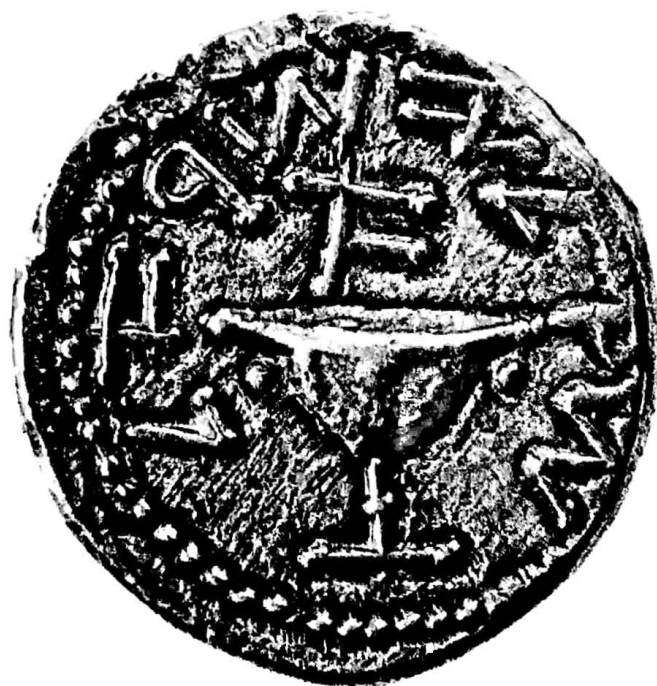
A silver shekel from the first year of the Jewish War.

In the desolate regions beyond the Jordan, Jewish Christianity made contact with various groups that had also abandoned orthodox Judaism. Lacking contact with the rest of the church, that Jewish Christian community followed its own course, and was often influenced by the many sects among which it lived. When, in later centuries, Gentile Christians deigned to write a few words about that forgotten community, they would speak of its heretics and its strange customs, but they would have little of positive value to say about that church, which faded out of history in the fifth century. It may be to some of them that Irenaeus referred when writing in the second century about some whom he calls "Ebionites" and who "circumcise, continue obeying the prescriptions of the