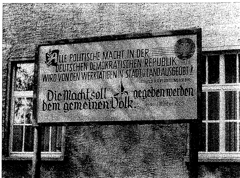
Figure 1.2 This sign outside the Allstedt Castle where Müntzer delivered his famous “Princes’ Sermon” juxtaposes lines from the constitution of the German Democratic Republic and from Müntzer to suggest their direct connection. The former reads: “All political power in the German Democratic Republic is exercised by the workers.” The latter reads: “Power shall be given to the common people.”